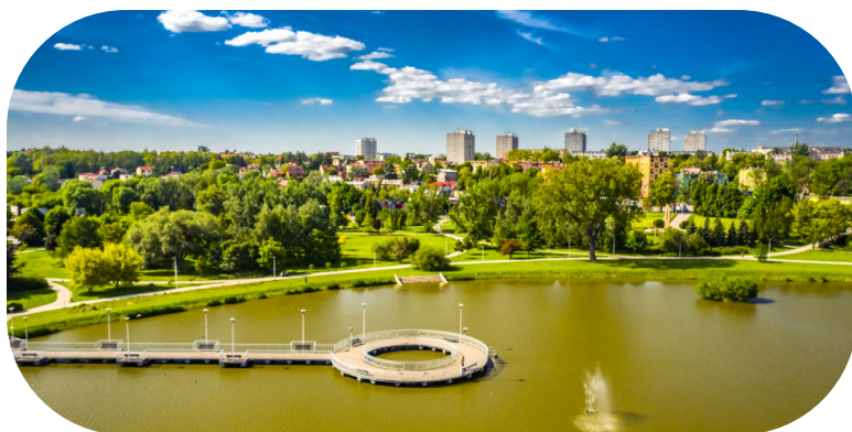
https://ostrowiec.travel/ Fot. Kamil Król

Ostrowiec Świętokrzyski is the second largest city in the Świętokrzyskie Voivodeship with over 60,000 inhabitants. It is also an important centre of the metallurgical industry. A clean, well-managed city with modern infrastructure is an example of a successful transformation in the post-industrial era. In Ostrowiec Świętokrzyski, we have many modern sports facilities (including a swimming pool complex where the Polish National Team trains), three parks, museums, and a beautiful Municipal Cultural Center. Ostrowiec Świętokrzyski is not a tourist town, but it is a great starting point for exploring the Świętokrzyskie Land. Right next to it there are: the Archaeological Museum and Krzemionki Reserve entered on the UNESCO list, a medieval monastery in the Świętokrzyskie Mountains, the ruins of the Krzyżtopór castle - an architectural pearl of 17th - century Europe, the royal city of Sandomierz (one of the most beautiful Polish cities), the Porcelain Factory and Museum in Ćmielów ( one of the most famous European porcelain factories). Really worth seeing!