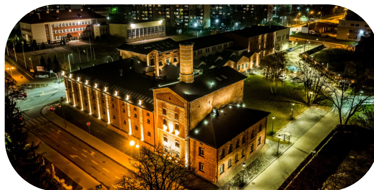
https://ostrowiec.travel/ Fot. Kamil Król